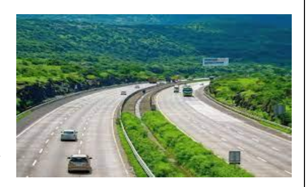
18 Oct 2022,

An expressway between Bangalore and Chennai has been in the pipeline for nearly two decades. India will have 26 new green expressways in the next three years and this will reduce the travel time for people choosing roadways. BangaloreChennai expressway will bring down the travel time between the two cities to just two hours.