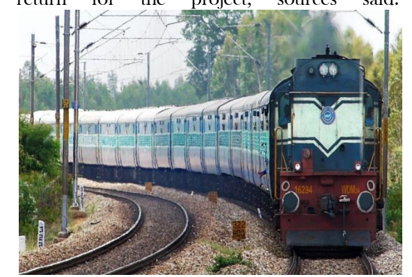
Sagar Sandesh News Service

For laying new lines, a preliminary engineering cum traffic survey will be conducted soon. "Engineering studies for laying new lines were being carried out since preindependence. Major towns are not covered through railway lines mainly because of geographical and topographical disadvantages. The traffic survey will cover freight and passenger traffic potential, classification of land, and rate of return for the project, sources said.