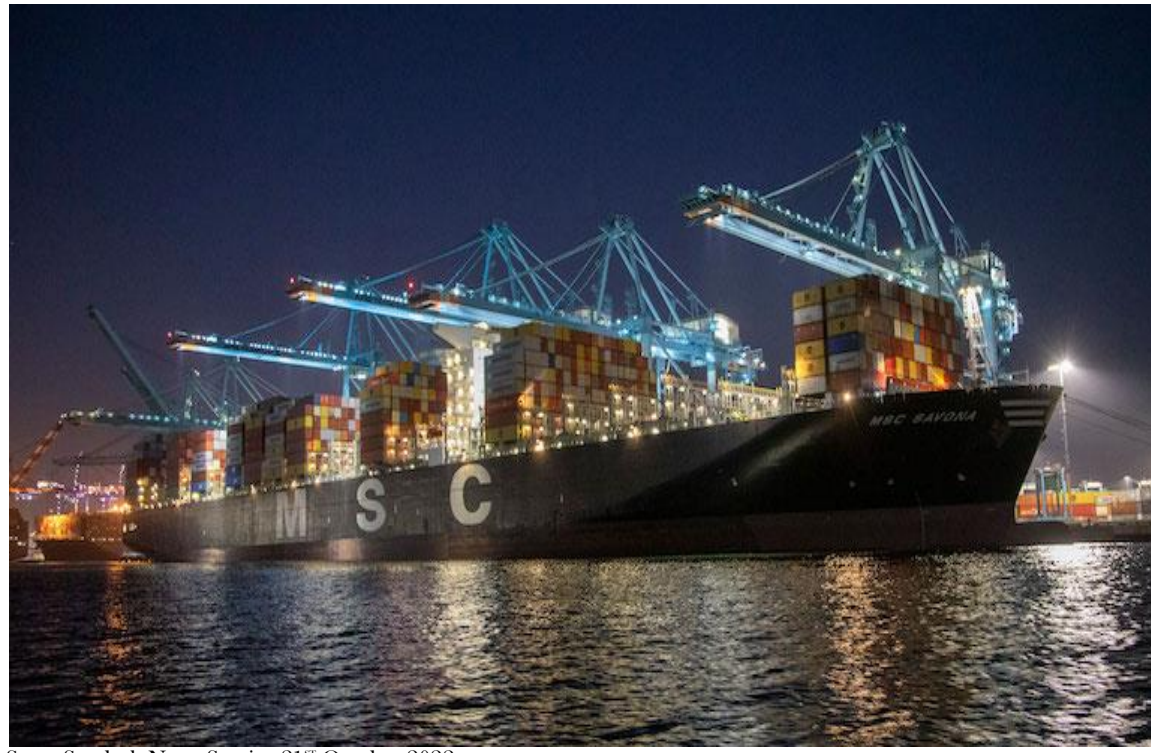
Sagar Sandesh News Service 21<sup>st</sup> October 2022.