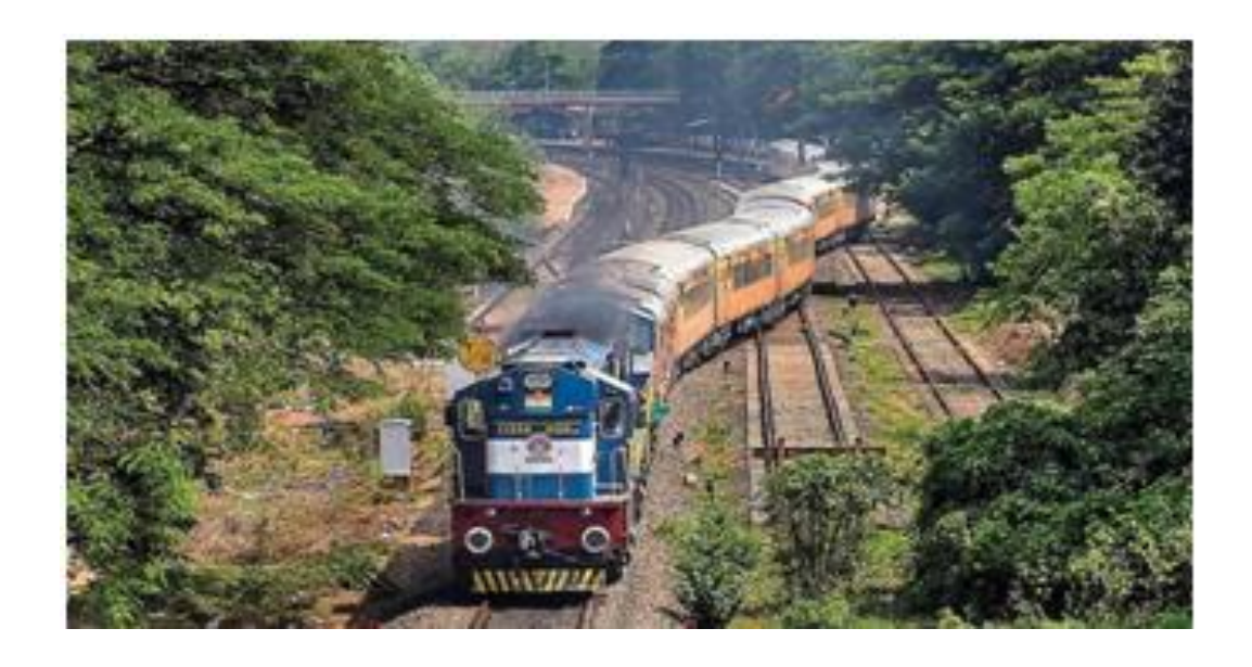
Sagar Sandesh News Service

Sagar Sandesh News Service, 14th December, 2022