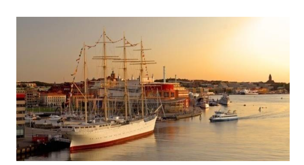
October 21, 2022

Stockholm, Copenhagen, Oslo, London, Bremerhaven, Lisbon, Malaga, Nice and Monaco. Barcelona will be its last stop during this year's expedition. In March 2023, the Gotheborg will set sail for Asia. It is scheduled to reach Shanghai in September 2023.