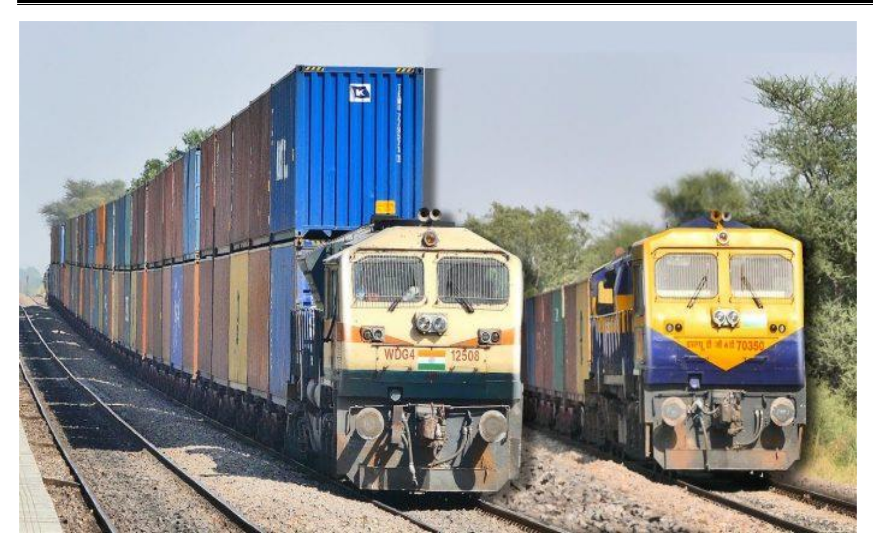
NEW DELHI Sagar Sandesh News Service December 30, 2022